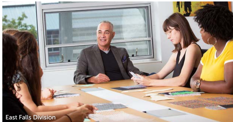
East Falls Division