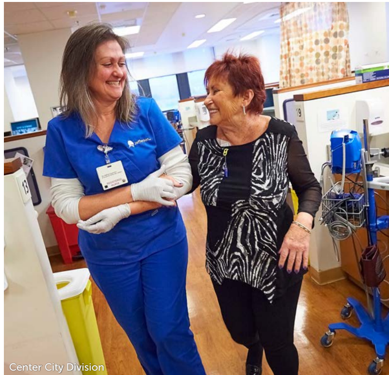
Center City Division

When you see something, say something. Reporting allows Jefferson the opportunity to correct system and process failures for the benefit of our community.