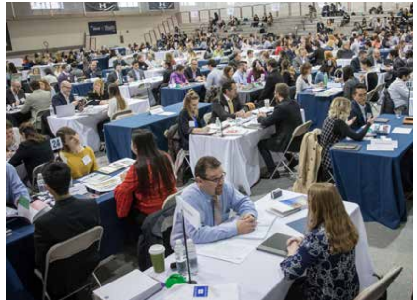
Design Expo 2018

The HireJefferson job board received 1,488 job postings (89% of which are internships or entry-level jobs), by 592 unique employers.