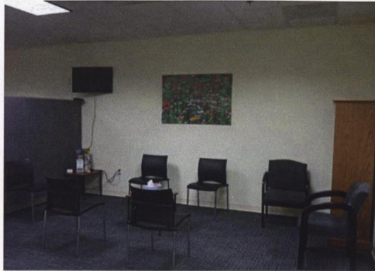
The waiting room

The Philadelphia Sexual Assault Response Center (PSARC) is not connected to the police department.